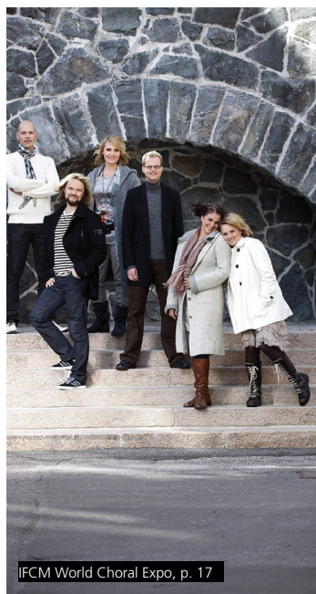
IFCM World Choral Expo, p. 17