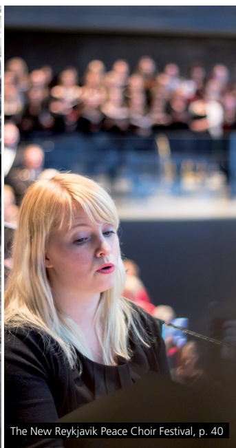
The New Reykjavik Peace Choir Festival, p. 40