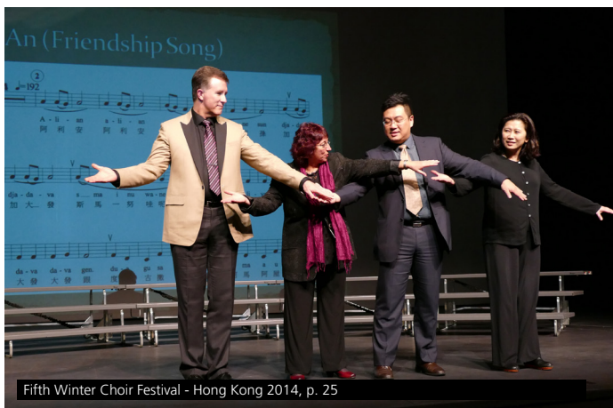
Fifth Winter Choir Festival - Hong Kong 2014, p. 25