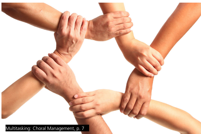
Multitasking: Choral Management, p. 7

3rd Quarter 2015 - Volume XXXIV, Number 3